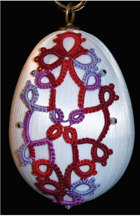
White Satin Covered egg -3.5" X 2.5" Lizbeth® Thread Size 10 color 102 (Western Sunset)