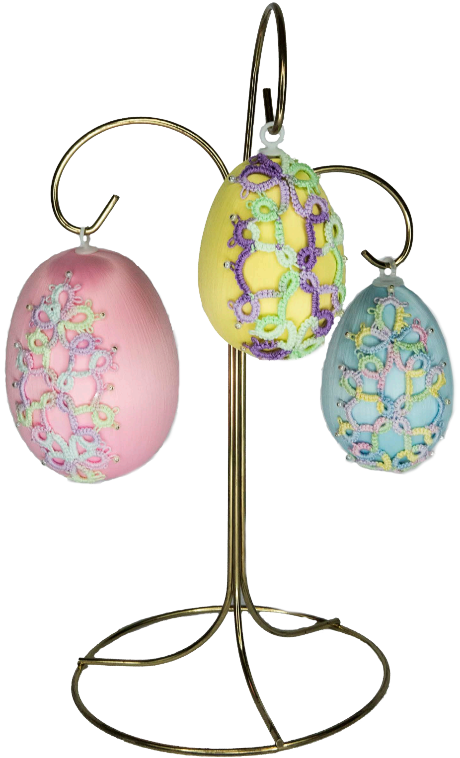
Light Pink Satin Covered egg - 4.5" x 3" - Lizbeth® Thread Size 10 Color 159 (Easter Eggs) Yellow Satin Covered egg - 3.25" x 2.5" - Lizbeth® Thread Size 10 Color 175 (Scottish Thistle) Light Blue Satin Covered egg - 3.2" x 2.5" - Lizbeth® Thread Size 10 Color 186 (Pastel Petals)