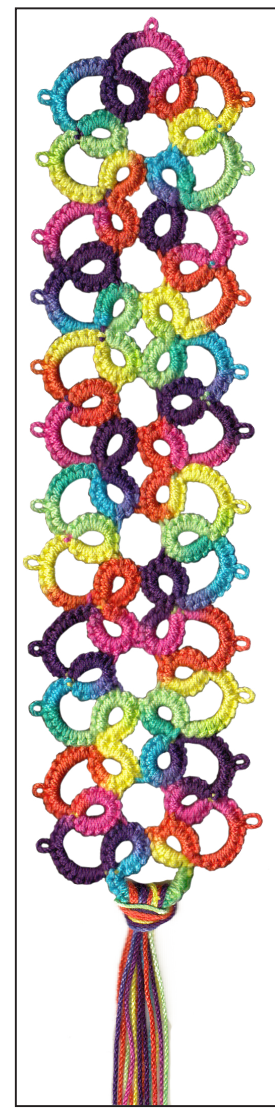
Lizbeth Color 184